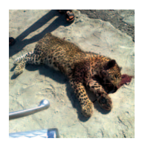
Fig. 2. Female leopard carcass after the road accident in Bashagard .